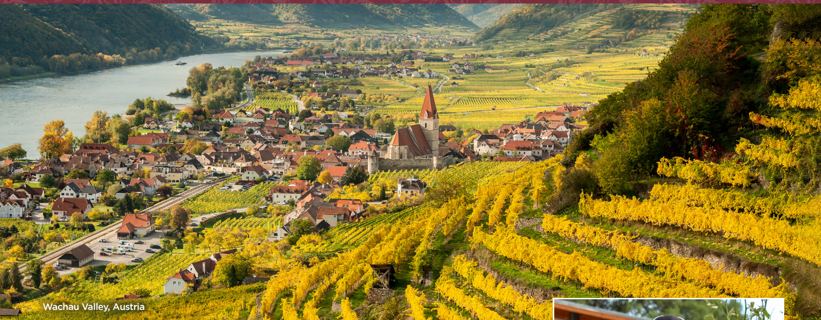
Wachau Valley, Austria

Uncork local traditions, savor intense flavors and enjoy palate-pleasing adventures during an AmaWaterways Wine Cruise